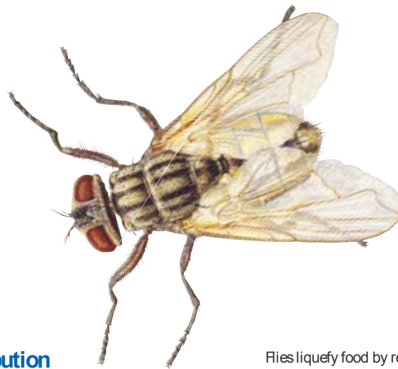
Common Housefly 14mm wingspan

Adults, 6mm long with 12mm wingspan; grey thorax with 3 longitudinal stripes, less pronounced than those of Common housefly; extensive yellow patch at base of abdomen; at rest, wings are folded along back; venation shows 4th vein extending straight to wing margin.